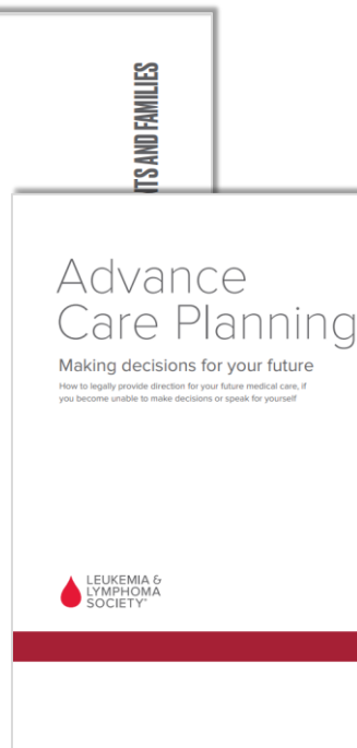
Advance Care Planning