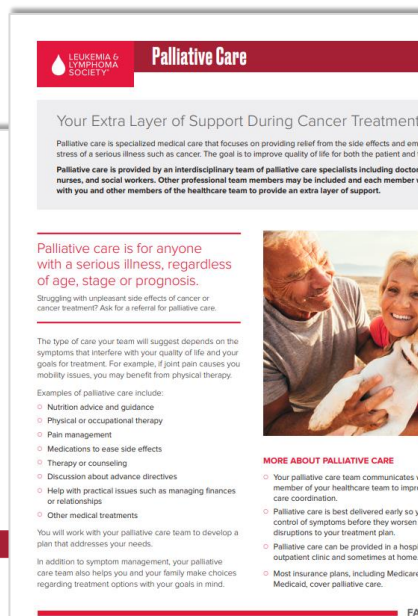
Palliative Care Fast Facts